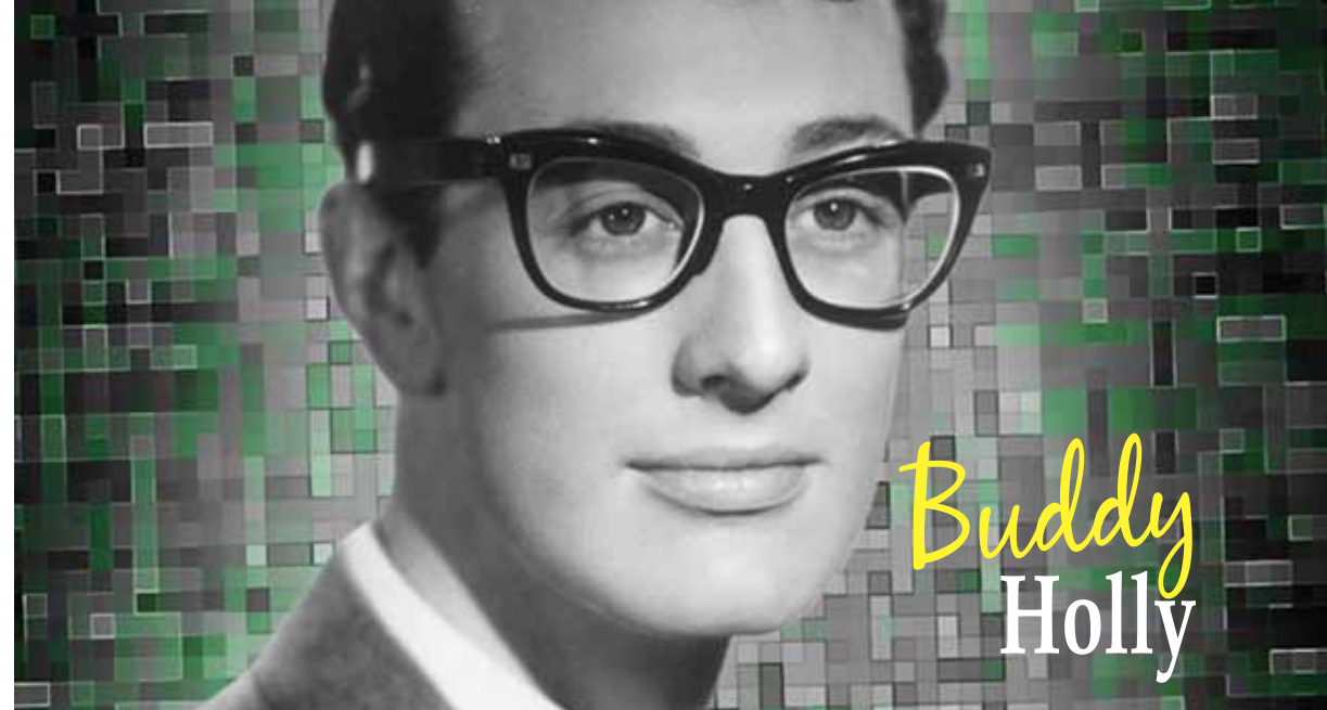
RAVE-ON! THE MUSIC OF BUDDY HOLLY, Brick 5/7 & Lacey 5/13

I'm an Artist is a heartwarming documentary about young adults with physical, emotional and mental disabilities and a dedicated art teacher with unwavering enthusiasm that helps them create their own art work. Through her guidance, she helps them gain self-confidence and self-acceptance as they express themselves artistically. Note to educators: Ocean County Library is a Professional Development Provider registered with the NJ State Department of Education. Registration is required. Toms River Branch Monday, May 11 at 7:00 pm