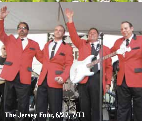
The Jersey Four, 6/27, 7/11